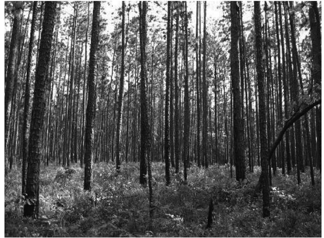
Figure 1. A, The Farm 40 as it appeared from an established photo point in 1952. B, The Farm 40 as it appeared from the same photo point in 2008.

resulting inventories from this unique long-term management effort.