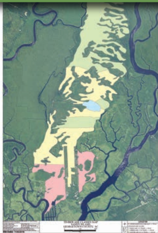
Upland timber age classes on Sandy Island. Green = mature longleaf (80-150 years), yellow = intermediate longleaf, and blue = young longleaf (<15 years). Other upland habitats are in red.