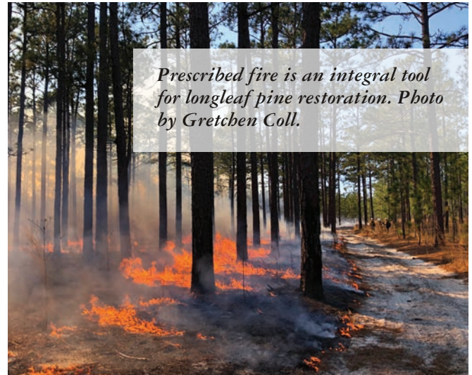
Prescribed fire is an integral tool for longleaf pine restoration.