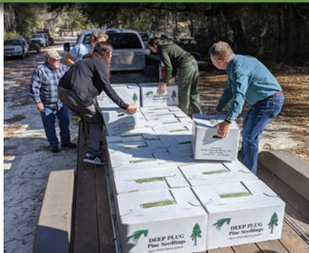
Florida Fish and Wildlife Conservation Commission and Florida Forest Service staff loading seedlings designated for private landowners restoring fire-damaged longleaf on 500 acres.

The Okefenokee-Osceola Partnership (O2LIT) enjoyed a productive spring planting season. From the feedback received from prior outreach workshops and by working with private landowners, we were able to identify several areas of land prepped and ready for longleaf restoration. Through a cooperative effort with our partners, over 57,000, second-year, containerized longleaf pine seedlings were recently distributed and planted. These seedlings were provided by the Okefenokee National Wildlife Refuge in conjunction with partners in the O2LIT to meet longleaf restoration and outreach goals in our area.