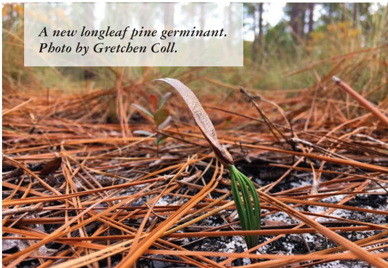
A new longleaf pine germinant.