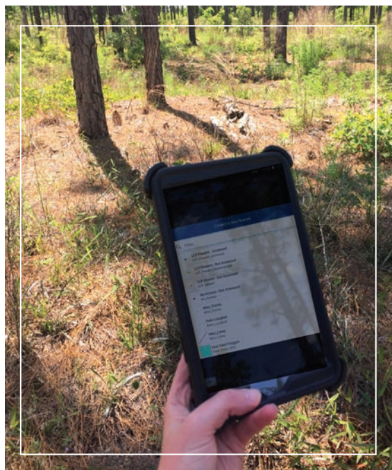
A mobile app was developed for the LEO project. Field teams can use a variety of device types to take surveys.

Forming field teams – We craft an individualized approach for each landscape with guidance from the partners. The local knowledge of partners plays a key role in this step by informing us on priority areas and interests. Field work occurs with partner help and contractors. After a training session, field teams