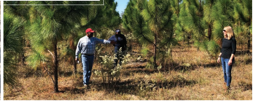
Members of Longleaf for All walk along a fire break in a longleaf stand.