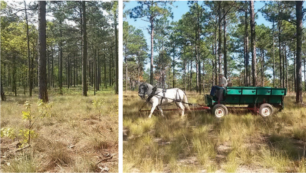
Blue Farm's longleaf and wiregrass, as far as the eye can see. Horse-drawn cart on The Walthour-Moss Foundation.

Classic open longleaf pine woodlands are a sight to behold. The majestic beauty that draws us to it as landowners and land managers also inspires others to live among these tall trees. This is the ironic conundrum of conserving well-managed older longleaf stands in areas experiencing rapid human growth; we are susceptible to loving them to death. Fortunately, development will not be the outcome for two significant properties in the North Carolina Sandhills due to generous private protection actions in 2021.