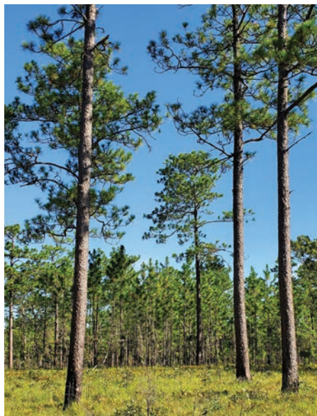
Blackwater River State Forest near RMS Land.

By Vernon Compton, GCPEP Director, The Longleaf Alliance