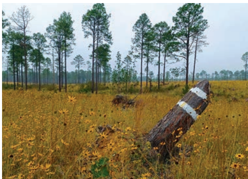
Post-salvage area showing damaged former RCW cavity tree.

The Kisatchie National Forest (KNF) was recognized by the 2021 Regional Forester's Honor Awards for the staff's response to Hurricanes Laura and Delta that hit in 2020 and reshaped portions of the 182,000-acre Calcasieu Ranger District. The District responded by structuring creative sale packages resulting in profit to KNF rather than paying contractors to take away unmerchantable trees. Of the 20,000 acres flattened, almost 13,000 have been salvaged and are now ready for planting longleaf seedlings. As a result, 53,000 cunits (100 cubic feet or ccf) of mostly salvage timber was sold. For these efforts, the Calcasieu District of KNF was recognized as the 2021 'Ranger District of the Year.'